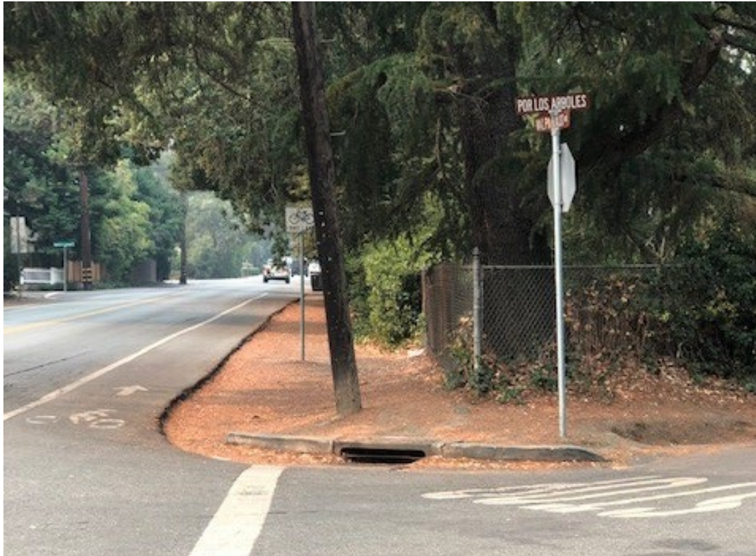
Camino Por Los Arboles @ Valparaiso Ave.